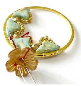
13) Place 1 Flower and 1 R11, go back through the flower only and place yourself in the 6th seed beads HERE.