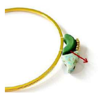
4) Place 1 Helios.