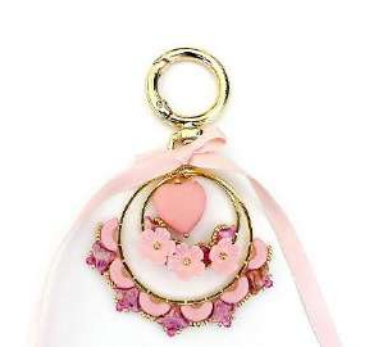
20) Another color 😊 .