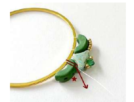
6) Place 1 Arcos and repeat steps 2 to 5 to place 6 Arcos in total