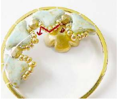
14) I returned my work to understand well \circ .