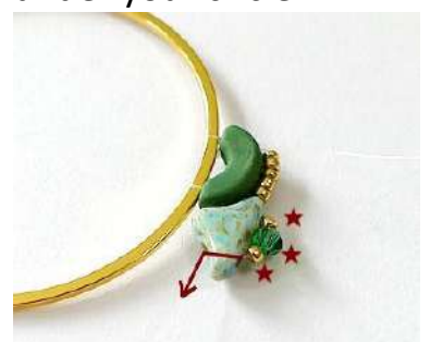
5) Place 1 R15, 1 T3 and 1 R15 in the second hole of the Helios HERE.