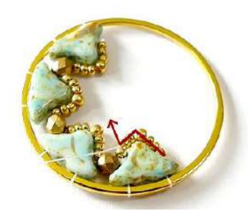
12) Repeat steps 9 to 12 to place a total of 4 Helios. © Come and place yourself HERE in the 6th seed beads