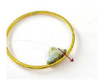
9) Place 1 Helios.