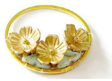
15) I repeat steps 12 to 14 to place 4 helios and 3 Flowers in total ♥. Close your thread.