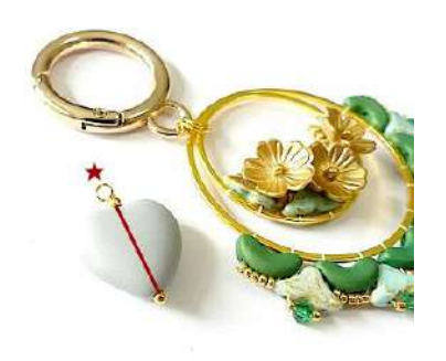
17) Then I place my stem on the heart making a nice loop ♥.