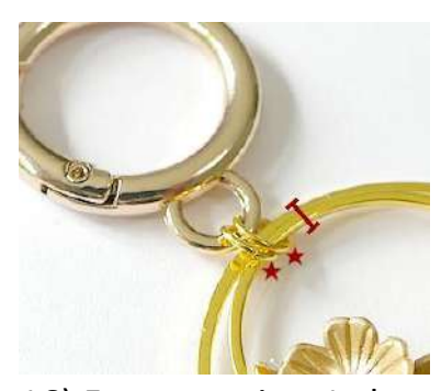
16) For mounting: I place my two circles together on the key holder using two rings.