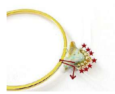
10) Then place 3 R15, 1 R11 and 3 R15 in the second hole of the Helios and go up into the Helios HERE.