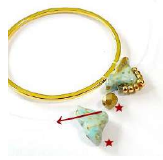
11) Place 1 F3 and 1 Helios.