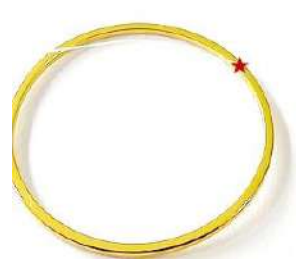
8) Place your wire on the30 mm ring.