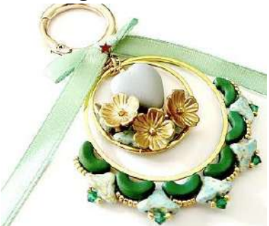
19) I place a thin ribbon to embellish my bag Bijou