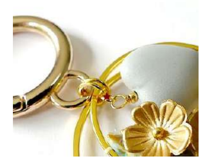
18) With another ring, I place my heart on the two starting rings.