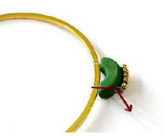
3) Pass over your circle and then into the Arcos HERE.