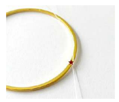
1) Place your thread with a knot on your 40mm circle.